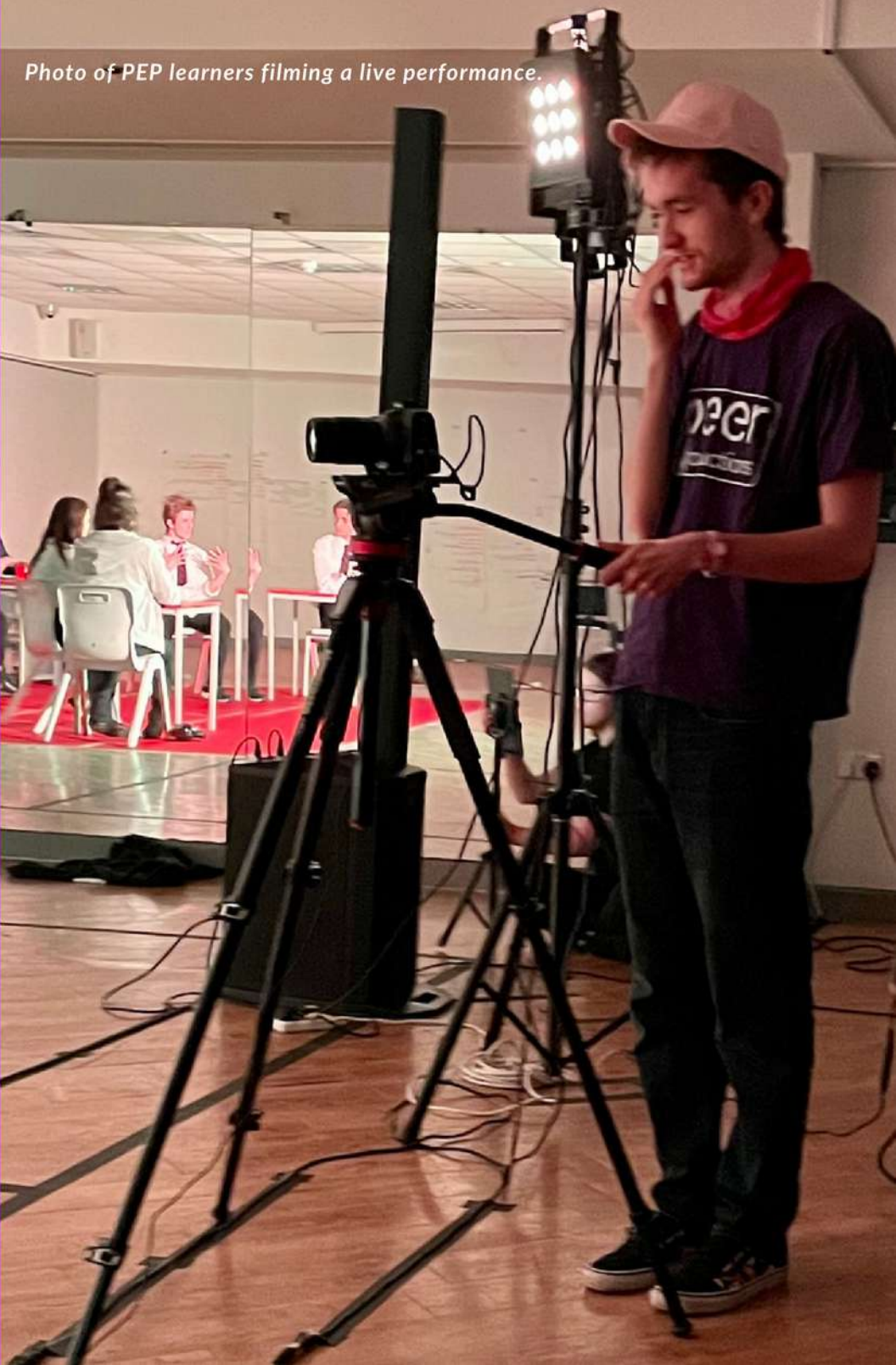
Photo of PEP learners filming a live performance.