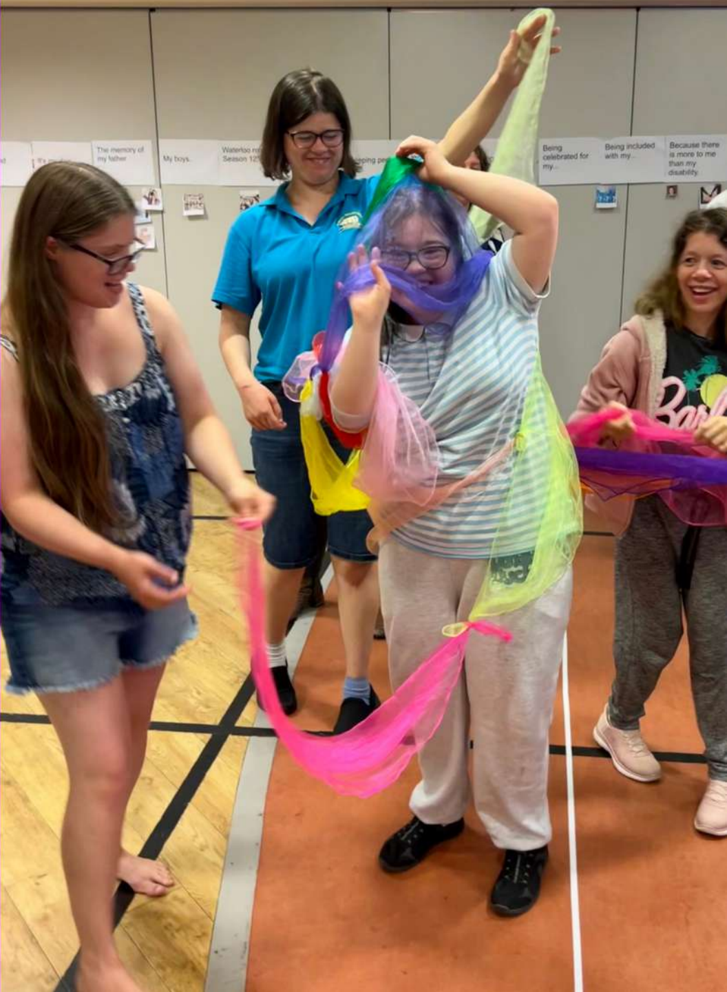
Photo of PEP actors in workshop for Arts Council Funded 'Story of Us' project