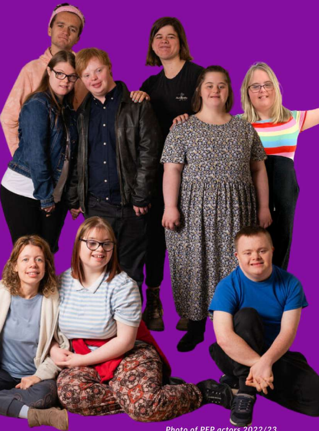
Photo of PEP actors 2022/23