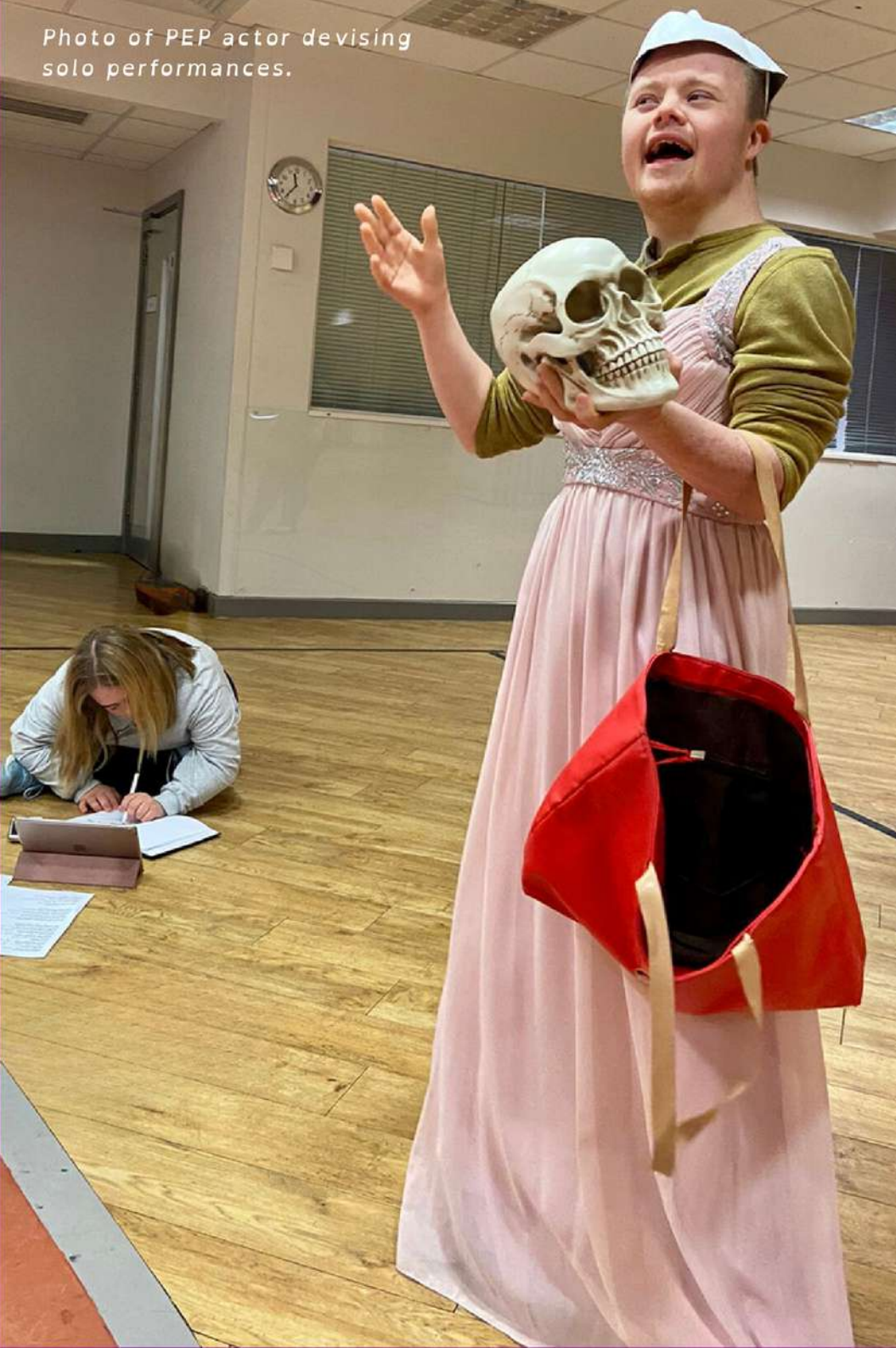
Photo of PEP actor devising solo performances.